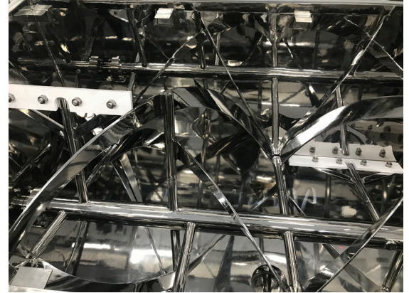
Figure 2 : Double helical ribbon design with Teflon scraper