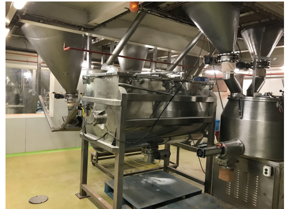
Figure 3 : Ribbon Blender with vacuum feeders on top.

Multimix Vacuum Ribbon Blender Mixer (RBM) Series is mainly designed for the blending of dry powders products such as spices, cosmetic compact powder, detergent, cleaning chemicals, coffee powders etc. A special liquid spraying system (LSS) can also be added when incorporating liquid phase in the powder. This series can also be enhanced with vacuum design in order to eliminate "powder" pollution when powders need to be incorporated into the mixing chamber. The vacuum mechanism sucks the powder into mixing chamber, thus effectively preventing the powder which is light in nature from dispersing in the surrounding air leading to powder pollution usually seen in conventional method of direct pouring of powders into the mixing chamber.